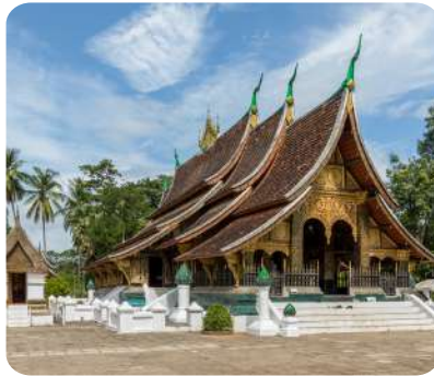
Wat Xieng Thong